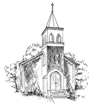
St. Stanislaus, Chatsworth Sunday 9:00 am